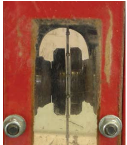
The guides need to be as close as possible but not touching

Cut one side of your tenon and then flip over, cutting the other. Remove the waste and check the fit. When this is satisfactory cut all the tenons on these settings. The key to success here is that the spare piece is identical to the other components and that this is checked carefully for fit before cutting the real thing.