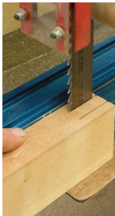
With one side of your spare component cut, flip over to cut the other side