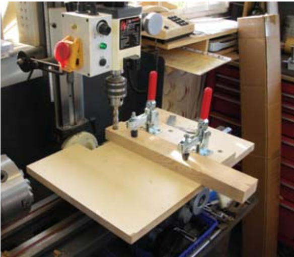
This jig can be used in conjunction with router tables too

Thanks to micro adjustment you can machine up to your scalpel lines