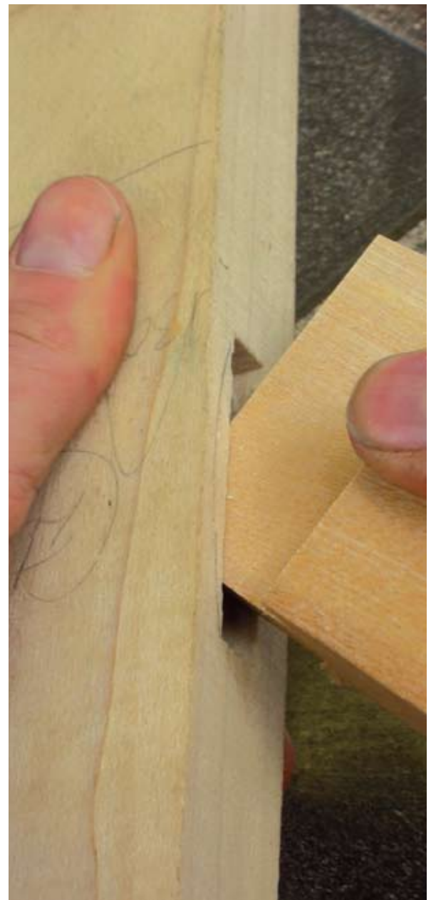
Check for accurate fit then cut the real thing