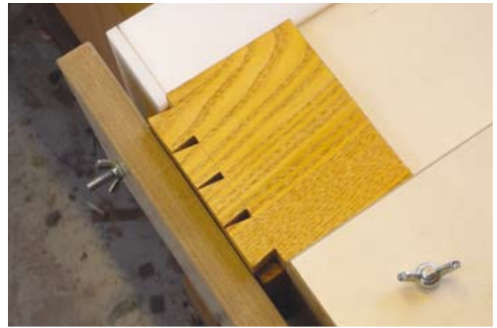
12 Move the tail board forward by enough to offset the scalpel line by its own thickness so the pins are marked on the outside rather than the inside