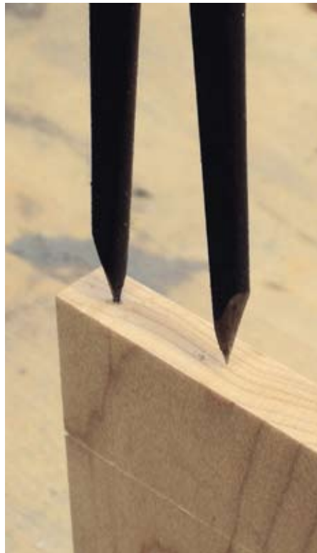
6 Place the dividers in the half-pin mark...