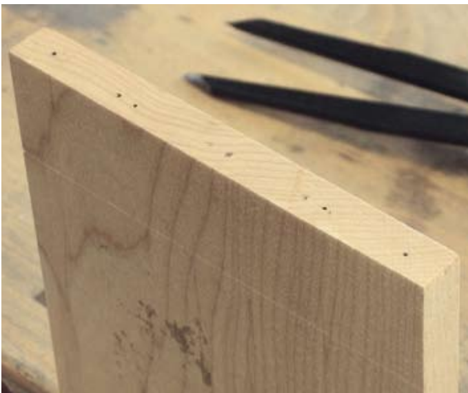
8 ... and all the spacings will be marked