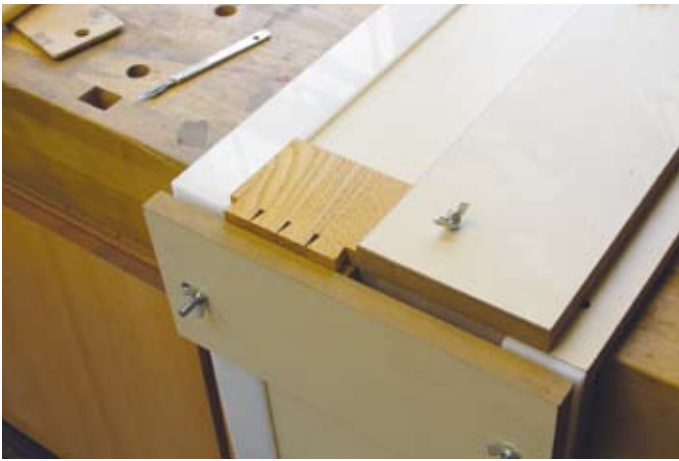
11 Use of a transfer jig allows timber up to 1000mm long to be marked up