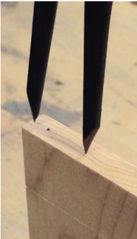
5 The amount by which the divider overhangs the half-pin mark is the width of one pin