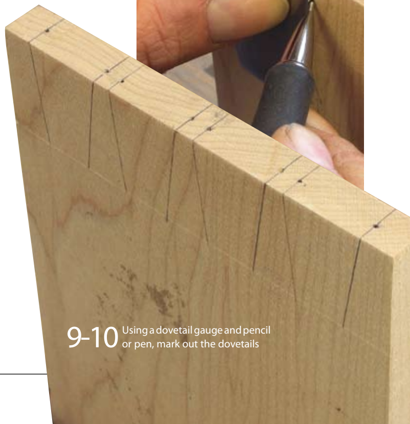
9-10 Using a dovetail gauge and pencil or pen, mark out the dovetails