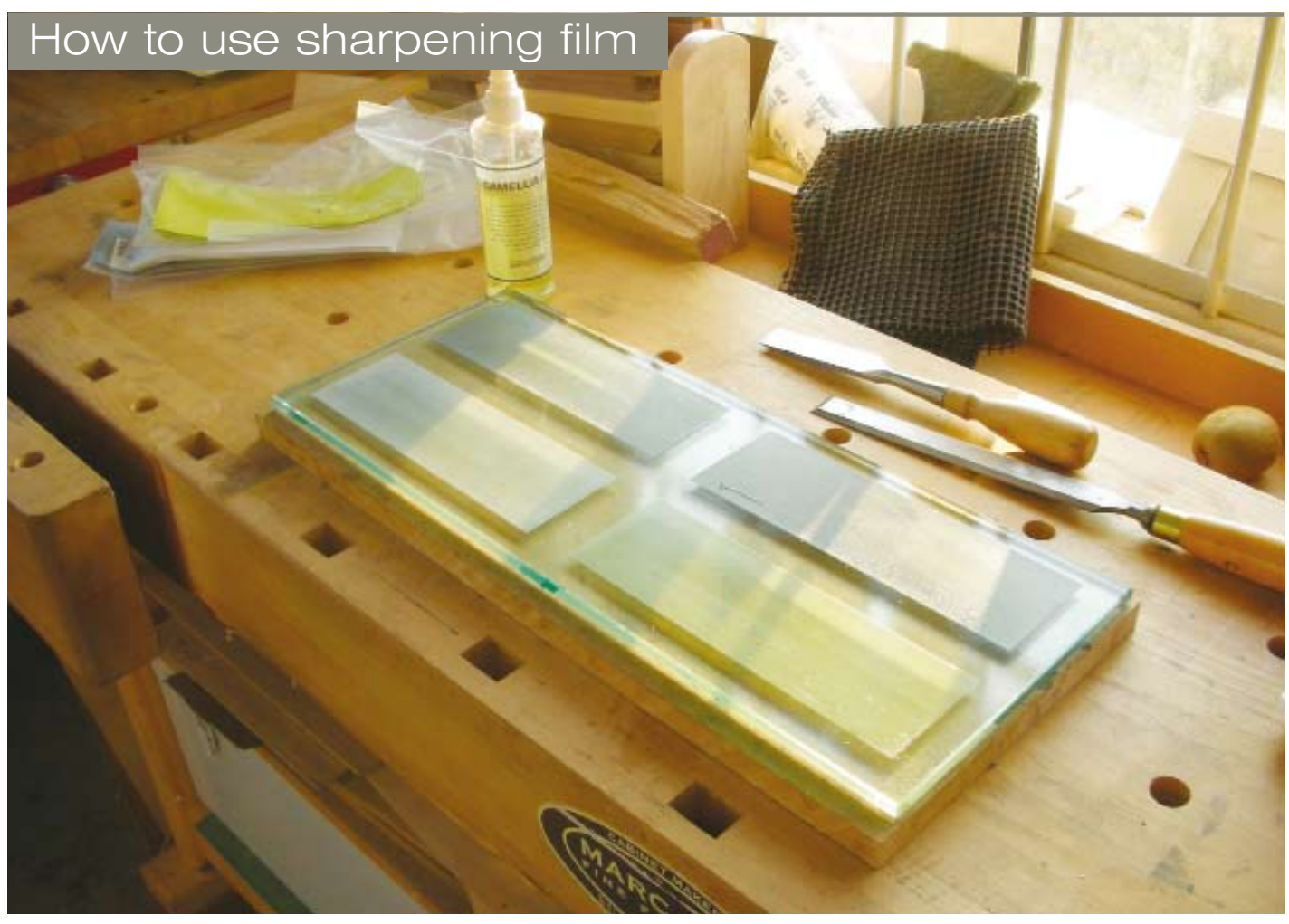
The general layout

Simply stick the film onto your substrate. I purchased from my local glaziers a piece of 10mm plate glass. This is NOT toughened or laminated as this can warp the glass. Ask the glaziers to polish or bevel the edges as this will stop you cutting your hands.