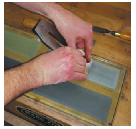
Freehand-honing a plane iron