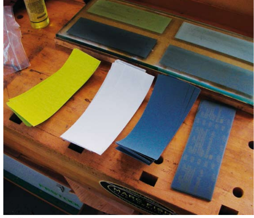
The different grits

The film comes in suitably large 215 x 280mm sheets. Divided by three, the sheets are enough to fit a No.8 jointing plane blade.