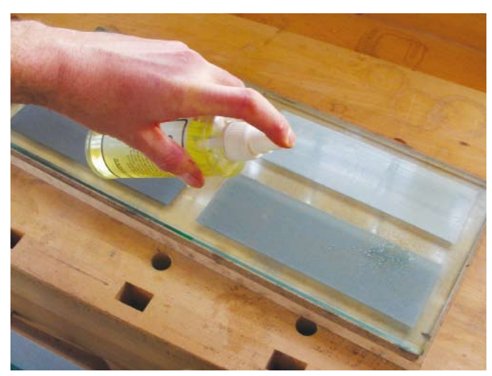
Applying camellia oil with spray