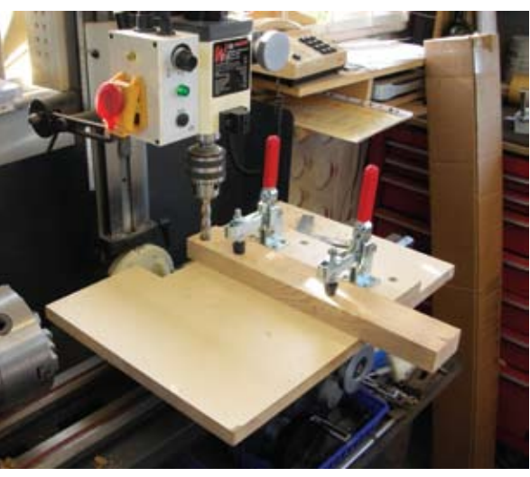
This jig can be used in conjunction with router tables too

Thanks to micro adjustment you can machine up to your scalpel lines