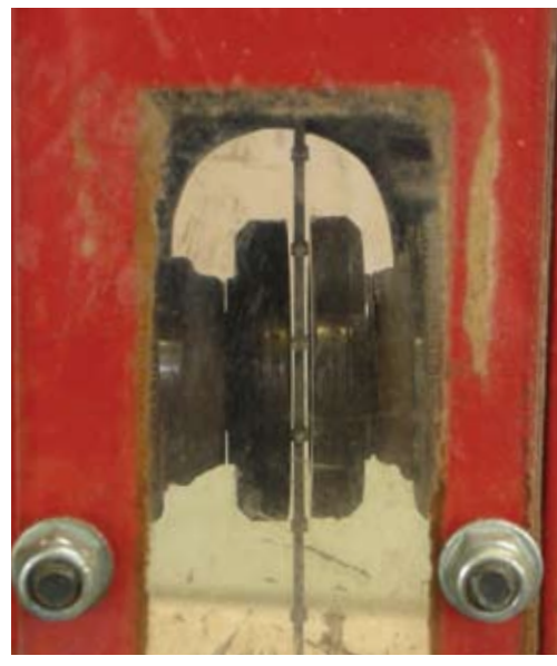
The guides need to be as close as possible but not touching

Cut one side of your tenon and then flip over, cutting the other. Remove the waste and check the fit. When this is satisfactory cut all the tenons on these settings. The key to success here is that the spare piece is identical to the other components and that this is checked carefully for fit before cutting the real thing.