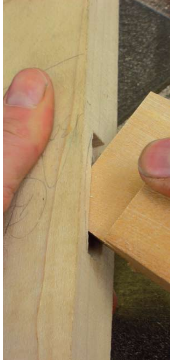
Check for accurate fit then cut the real thing