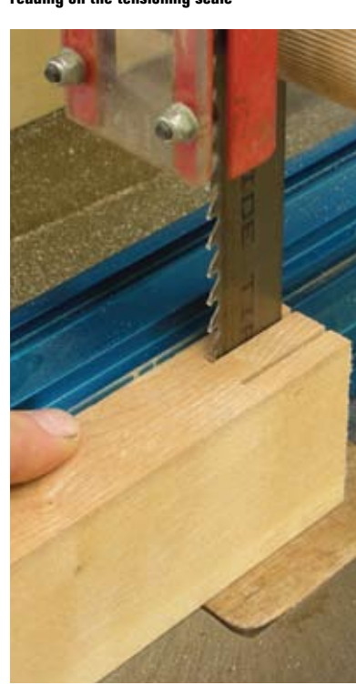
With one side of your spare component cut, flip over to cut the other side