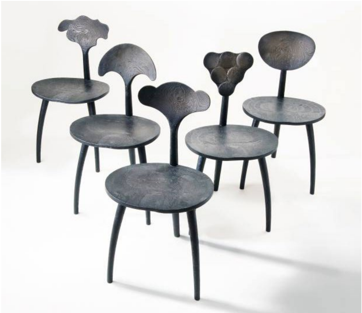
John Makepeace oak Black Trine Variations chairs, £14,400, from Sarah Myerscough Gallery

Makepeace's own exploration of fluid forms , spanning two decades, has produced the ground-breaking Flow cabinet (2006, made to order, £108,000), featuring a hand-shaped, digitally designed surface pattern of three-dimensional ripples, and the Undulate console (2016, from £25,000) with legs in carved and rippled sycamore. Recently, he has experimented with lamination. Black Trine Variations (2017, £14,400), created for Sarah Myerscough Gallery, is a series of three-legged chairs with internal metal connections made using technology "developed by Nasa for joining wooden blades to the metal hub of a wind generator on Hawaii". Each seat is made from 13 layers of English oak and the pattern results from the natural qualities of the timber, which has been sculpted and polished to reveal the