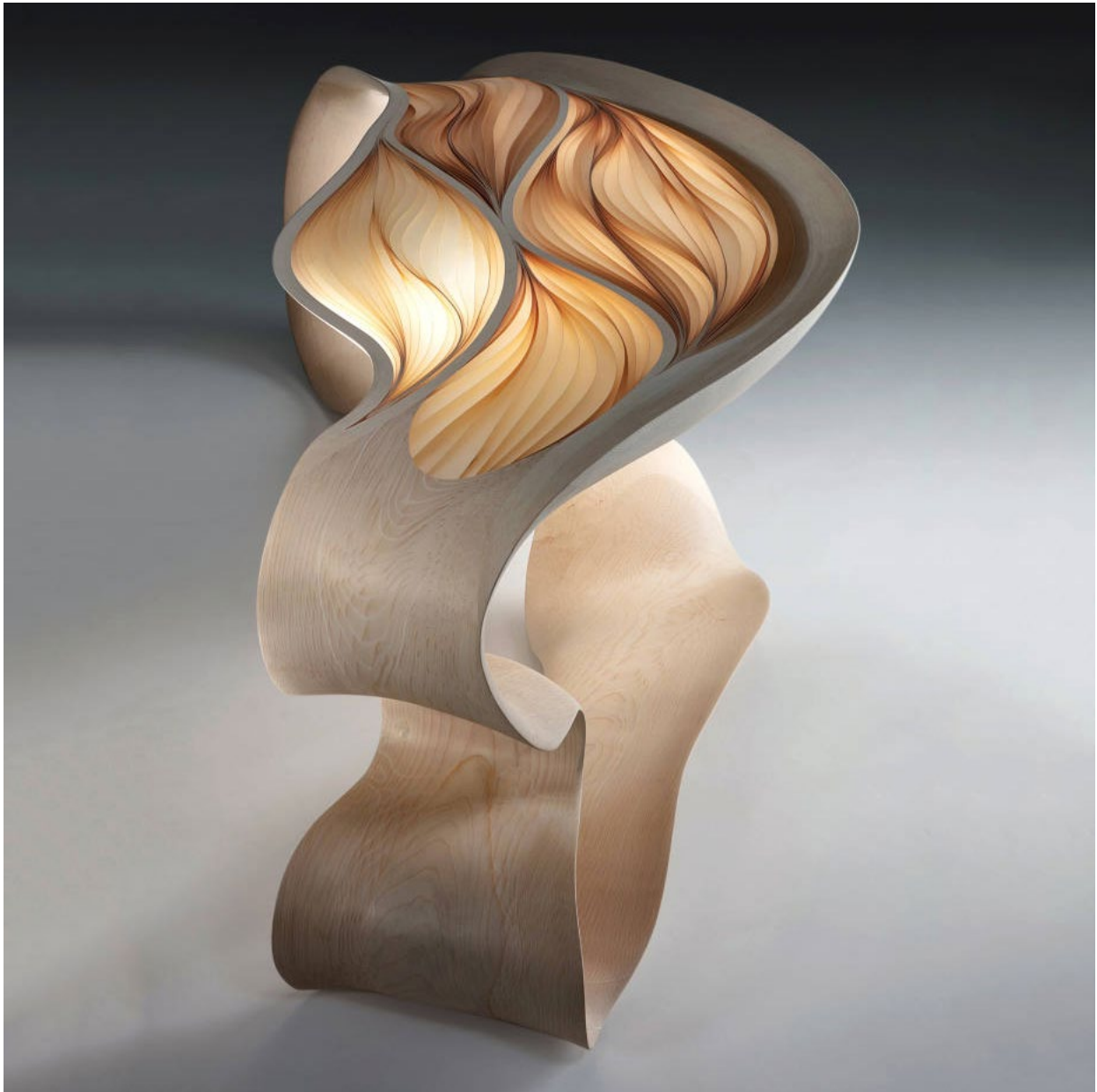
Marc Fish sycamore and acrylic Ethereal desk, $120,000, from Todd Merrill Studio