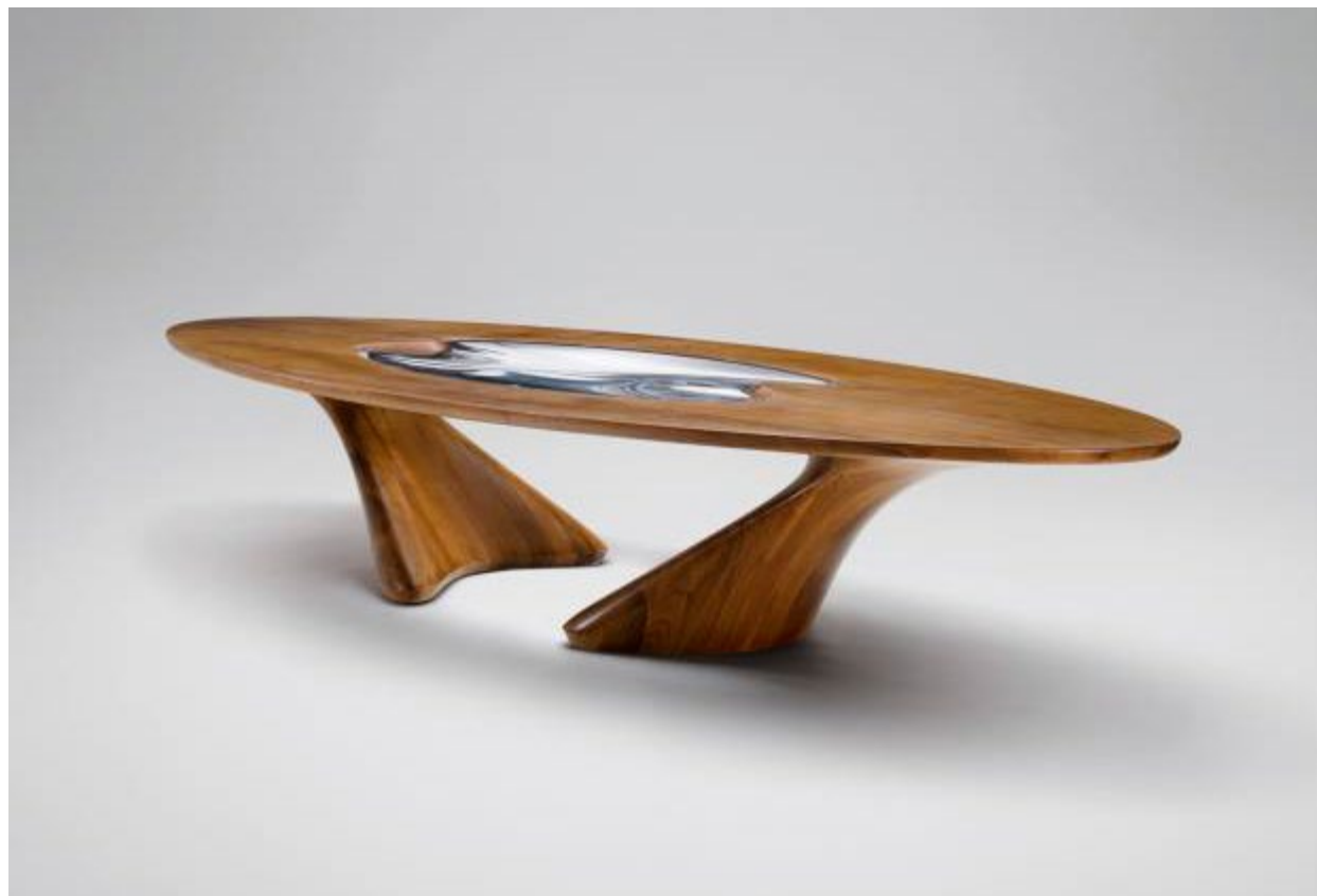
Zaha Hadid Architects American-walnut and acrylic UltraStellar dining table, from £198,000, from David Gill Gallery

skills and 21st-century techniques, makers are focusing on creating highly collectable curvilinear centrepieces for inspiring interiors.