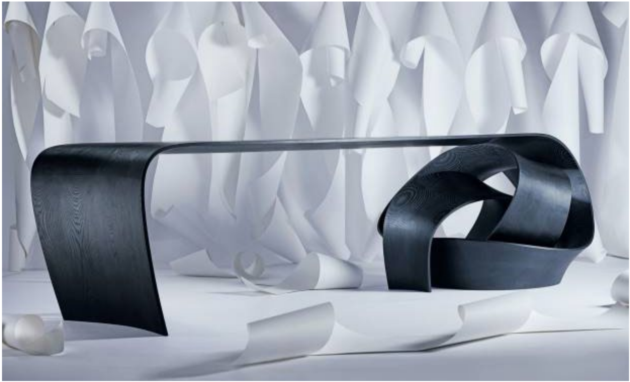
Object Studio ebonised-ash Nodum desk, £21,600

For collectors who are compiling a list of big game trophies to acquire, a key quarry is one of the most influential British designer-makers of his generation: John Makepeace. Makepeace is exhilarated at the rise of art furniture. “I’m really keen on realising the full potential of timber. I want it to flow freely in three dimensions,” he says. “Rather than using wood in the form of two-dimensional ‘planks’, I have been looking at ways to express the luxury of solid timber by sculpting the material, working it as a potter might work clay.”