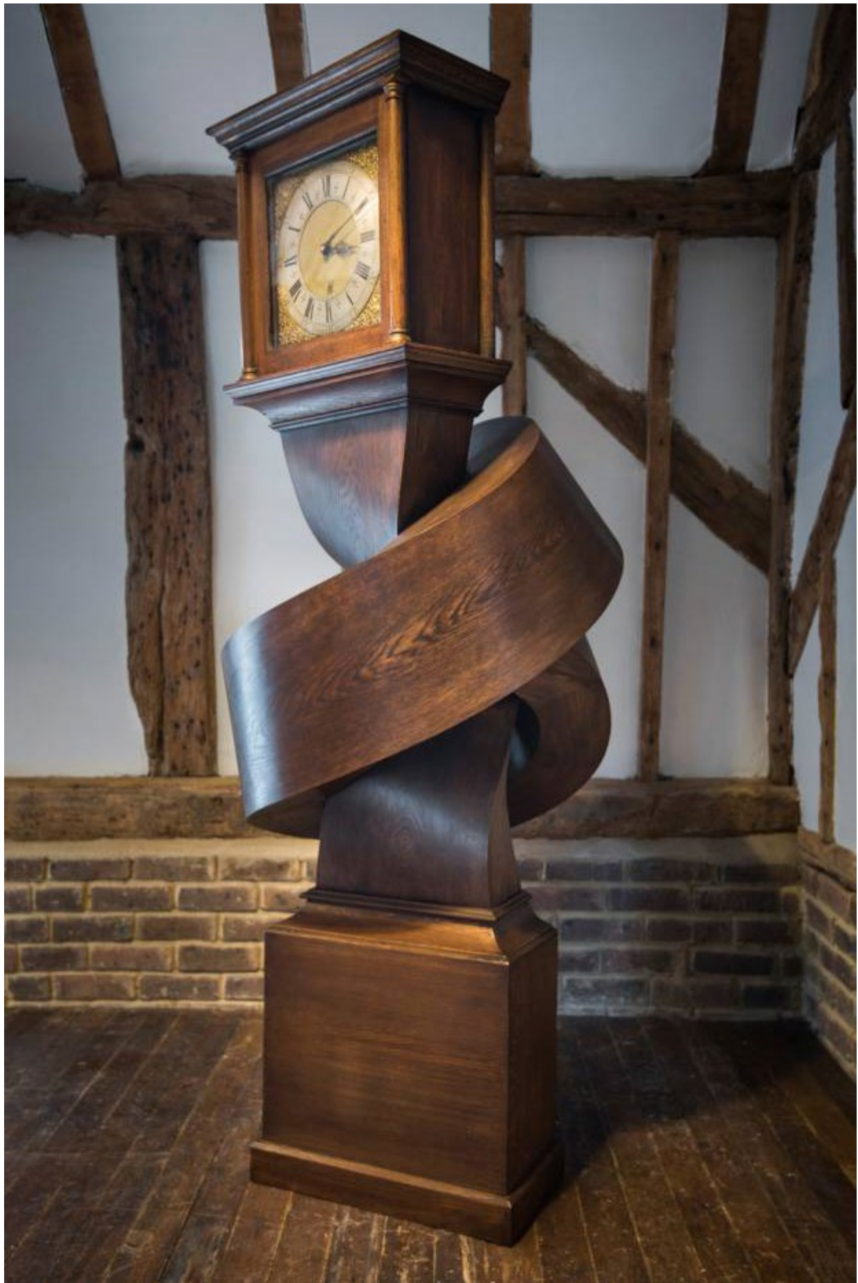
Alex Chinneck oak Growing Up Gets Me Down grandfather clock, $50,000 for edition